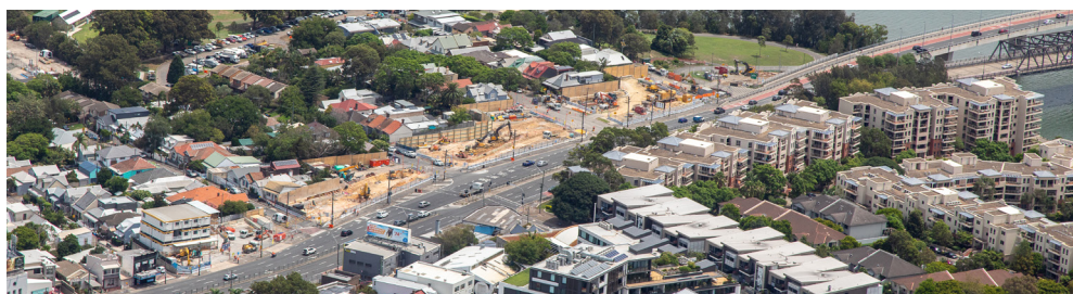
Aerial of Iron Cove

Road closures, bus stop relocations, cyclist and pedestrian changes required at Iron Cove have been delayed. Therefore key changes will be implemented from 16 April and 1 May respectively instead of 7 and 21 April as originally scheduled. All content within this factsheet is consistent with previous version issued 30 March however dates have been updated accordingly.