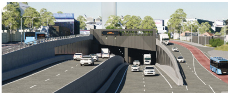
Above and below: artist impressions of view from Iron Cove Bridge approximately five years after completion.

Equipment required for work will include: road resurfacing plant and equipment including concrete pavers, rollers and compacting equipment, excavators, mobile cranes, piling rigs, rock hammers, concrete trucks and concrete saws.